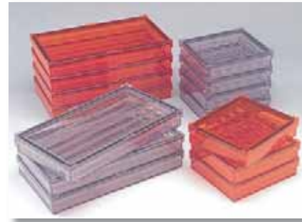
Multi-Purpose Incubation Chamber Large (for 20 sheets) 345 x 195 x 48 mm Small (for 10 sheets) 195 x 172 x 48 mm